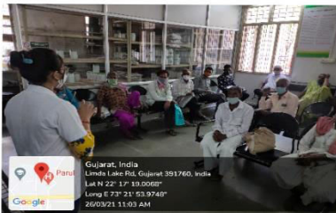
Picture No.7: Intern student promoting Ayurveda to patients of ParulAyurved Hospital through AYU-SAMVAD Lecture Series.