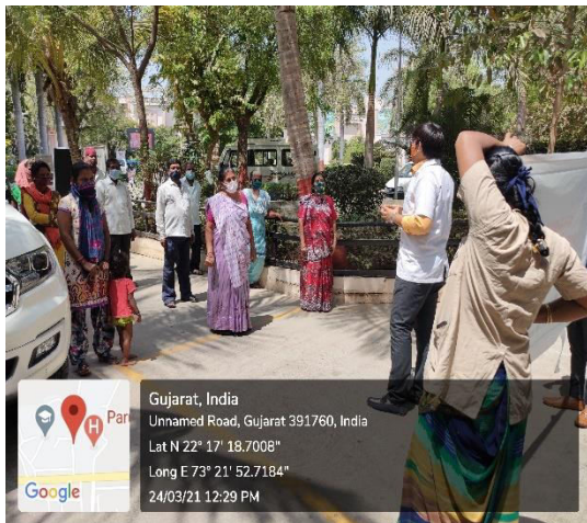
Picture No. 1: Intern student conducting AYU-SAMVAD orientation for patient's